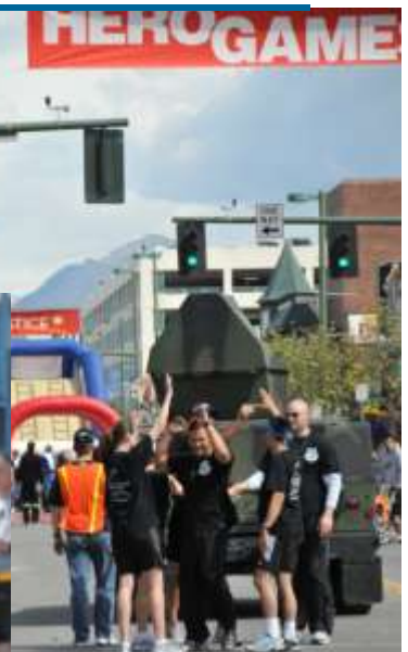
Group members participated in the Hero Games during the summer solstice celebration held between C and L Streets downtown.