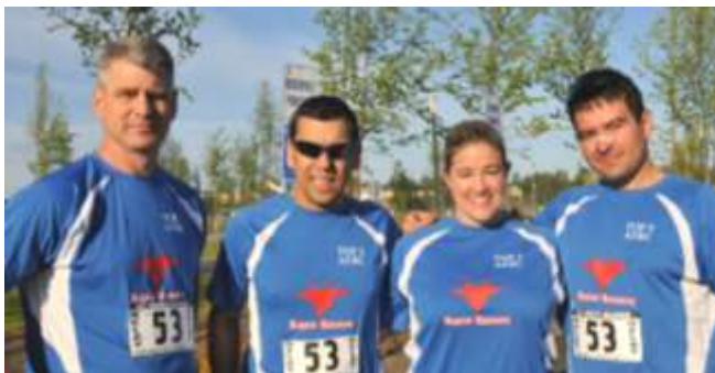
The 477 FG's "Raptor Runners" team ran the Mayor's Marathon as part of the Summer Solstice celebrations downtown.

With a time of 3:45, they placed 9th overall out of 47 relay teams!