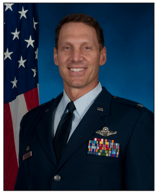
Welcome to the April UTA!

I am truly honored and privileged to be your 477th Fighter Group Commander. As I said at the change of command, this unit has a distinguished heritage and a proud history of incredible airmen. Today is no different. I continue to be amazed at how much we provide during a UTA and throughout the week flying, fixing, and supporting the F-22 mission.