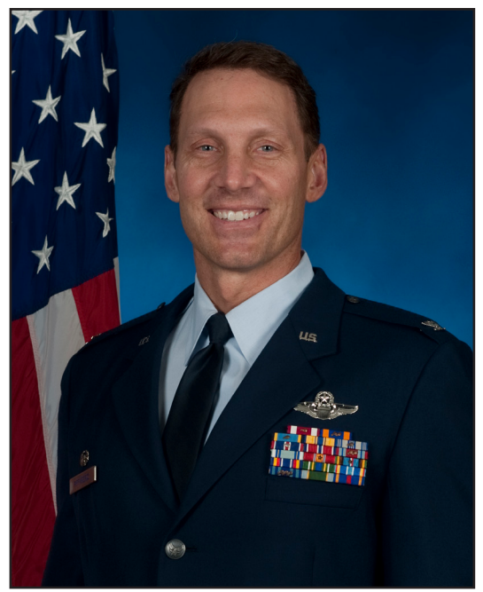
Greetings and welcome to the September UTA.