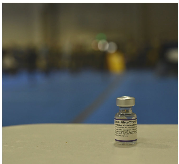
477th Fighter Group prepared to meet COVID-19 vaccinations requirements.